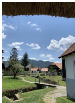
Village of Kumrovec

Then we headed out of town to Kumrovec, a little village so close to Slovenia that we could see the barbed wire border. Ok, so why did we go there? Kumrovec is important because it was the birthplace of Josip Tito, the President of Yugoslavia. We saw a bronze statue of Tito (I was struck by how short he was, standing only five feet seven inches), as well as a reconstructed village. It painted a really good picture of what life was like in the early 20th century.