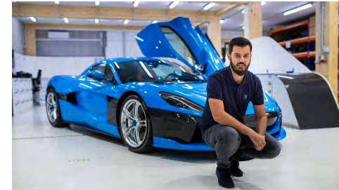
Mate Rimac, Automobile Entrepreneur

In the mid-2000's, Mate Rimac had a "garage hobby" at his home in Sveta Nedelja , Croatia — race cars. Not just any race cars, but truly high performance cars. After successfully converting his own and several other BMW 3's into fully electric versions, he started, in 2009, his own company, Rimac Automobili , with the goal of building the world's first electric sports car. This was when Rimac was merely 21 years of age. His first original product, the Formula One, was introduced at the 2011 Frankfurt Motor Show and the 2012 Paris Concours d'Elegance to very positive reviews; with a selling price of $ 980,000, the two-occupant Formula One, with carbon fiber body and all-leather upholstery, went into limited production.